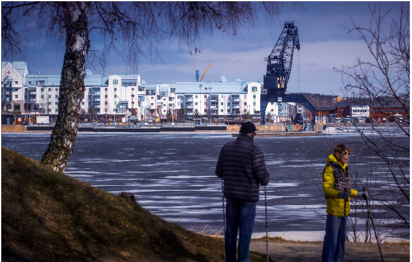
Image of macho Northern Swedish man must go to secure recruitment

A gun on his back, snus tobacco under his lip and a misogynistic worldview, he drives around on his scooter. This image of the primitive Norrlänning – a person from Sweden’s northernmost county – became ingrained with the 1996 movie The Hunters . Now Northern Sweden is hunting for people to carry out the so-called green revolution, and that image has to go.