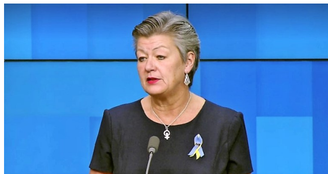
Ylva Johansson addresses the EU Parliament during the debate on the Ukrainian refugee crisis.

As the European Parliament gathered in Strasbourg on 7 March, the war was on everyone’s lips. The Ukrainian flag was flying next to EU flags and MEPs were expressing shock and upset as well as pride over a unified EU ready for action. Commissioner for Home Affairs Ylva Johansson was also present after visiting the Polish border to witness the flow of refugees during the first week of the war.