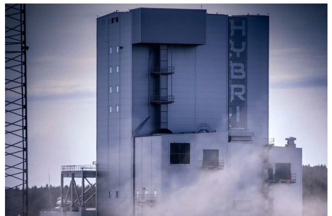
Hybrit's pilot plant in Luleå.

H2 Green Steel are not the only Swedish company wanting to produce fossil-free steel. The competitor is called Hybrit, an acronym for Hydrogen Breakthrough Ironmaking Technology. The owners are the steel company SSAB, the mining company LKAB and the energy giant Vattenfall.