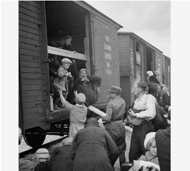
Evacuees from Parikkala in Karela arrive by train in Vilpula in June 1941.

More than 400,000 Finnish Karelian people were resettled elsewhere in Finland. They lost their homes and anything they could not carry with them. Parikkala municipality lost one-third of its area to the Soviet Union as borders were redrawn.