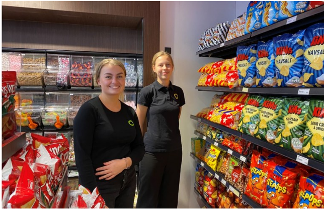
A worker who got a summer job through Nordjobb at a petrol station in the Faroe Islands.

Several countries are already allowing Nordjobb-workers in, including Sweden, Greenland, the Faroes and Denmark. In some countries, however, workers must undergo quarantine. Norway will probably not allow anyone in until after this summer unless something changes.