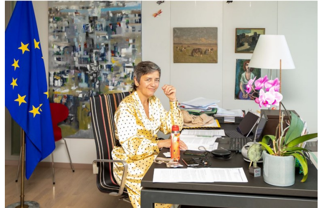
Margrethe Vestager is safe in her chair at her office at Berleymont in Bruxelles. She was re-elected in 2019.

She is also a well-known and respected profile on the international stage, although more well-known than respected among certain state leaders. Former US President Donald Trump called her Europe’s “tax lady” and “perhaps worse than any person I’ve ever met”.