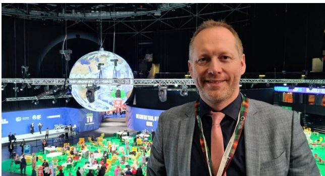
Guðmundur Ingi Guðbrandsson at COP 26 i Glasgow.

In that position, he became one of the best known environmental spokesmen and lobbyists in Iceland. However, politics did not seem to be part of his plans at the time.