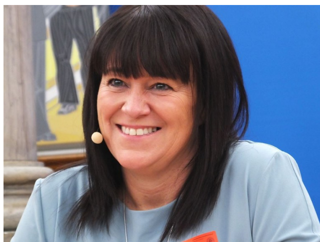
Anette Holmberg-Jansson is Minister of Social Affairs and Nordic Cooperation in the Åland Islands.

On Åland an evaluation of the Nordic cooperation was conducted in 2016. It came to the conclusion that full membership in the Nordic Council and the Nordic Council of Ministers would require financial and human resources to such a degree that the benefits of full membership would be outweighed. The main economic burden would come from the presidency of the Nordic Council of Ministers and the organisation of the Nordic Council sessions.