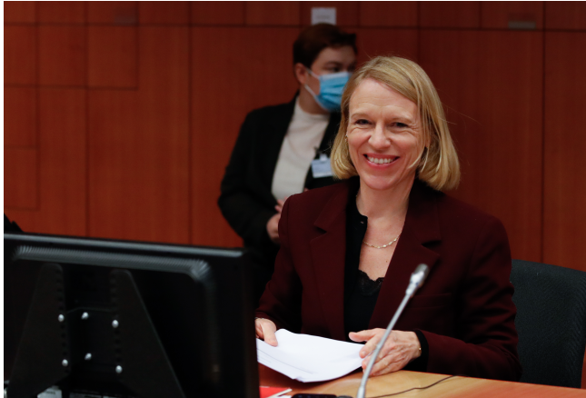
Anniken Huitfeldt is Norway's Minister for Foreign Affairs. Norway currently chairs the EEA/EFTA cooperation.

The difference is that Norway has the power to decide how these grants are distributed, to help reduce social and economic disparities elsewhere in Europe.