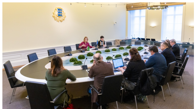
Kaja Kallas, Estonia's Prime Minister, meets a group of Finnish journalists.

As Estonia's Prime Minister Kaja Kallas met a group of Finnish journalists recently, she expressed satisfaction that Estonia this time could be the big brother in its relationship with Sweden and Finland.