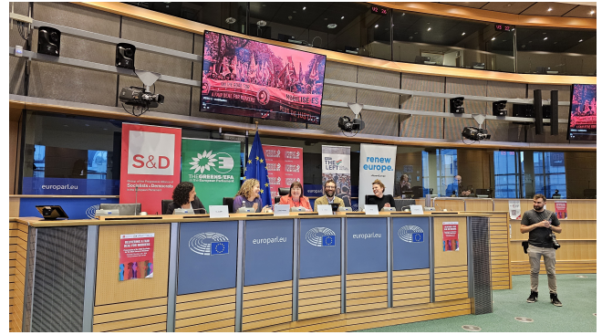
ETUC launched their manifesto ahead of the EU Parliamentary elections on 15 November last year..

“There is a social justice emergency in Europe. Over the past year, working people have suffered record real-term pay cuts while unscrupulous employers continue to register record profits. Meanwhile, the EU institutions threaten to return to austerity and open the door to further deregulation, punishing workers,” reads the ETUC manifesto.