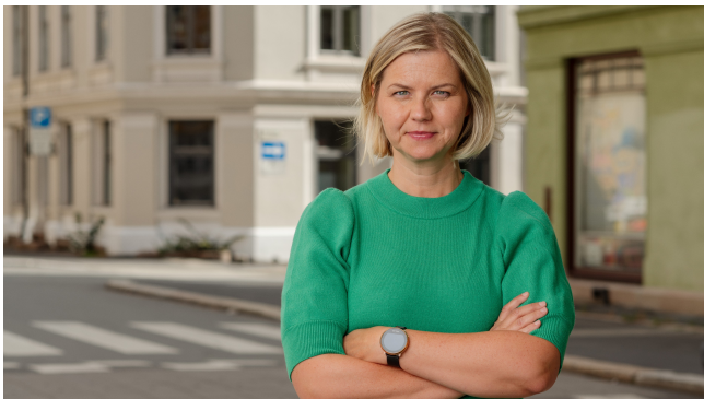
Guri Melby is the leader of the Liberal Party. She is ready to take Norway into the EU.

“Either we carry on with an increasing number of special agreements that voters and politicians from other countries draw up for us. Or else we could go for full Norwegian EU membership where Norwegians are actually able to influence EU policy that we end up adopting in any case,” says Melby in a statement on the Liberal Party’s website.