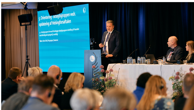
Johan Dahl, Faroese member of the Nordic Council from Sambandsflokkurin, during the Nordic Council.

So, discussions revolve around the development – not dissolution – of the realm. The countries seem to agree on this. The parties in the Nordic Council have different opinions, however. Iceland, Denmark and Norway recommend full membership for the Faroe Islands, Greenland, and Åland, while Sweden and Finland are against it.