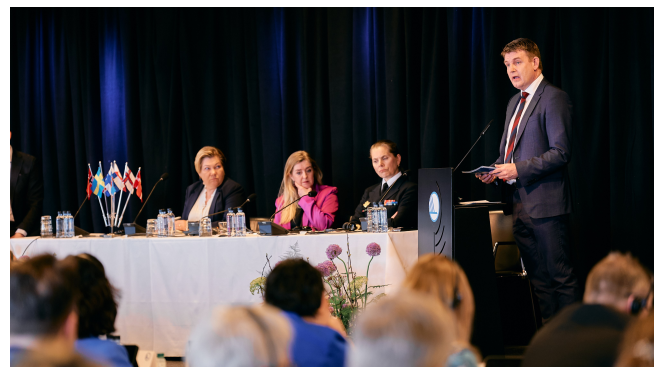
"The Danish government is absolutely open to dialogue," said Faroese Prime Minister Aksel V. Johannesen.

"Once upon a time, there was Denmark, and then there were two other countries in the realm. That's over now. It's not Denmark that should determine the future of either Greenland or the Faroe Islands. That decision belongs to Nuuk and Tórshavn.